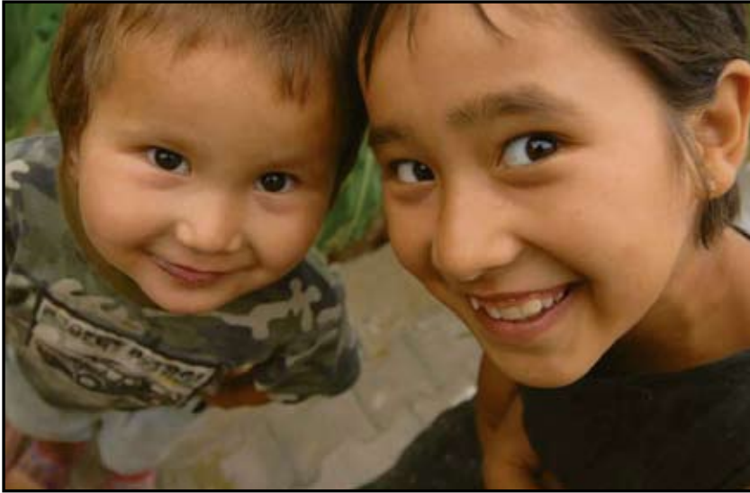
Children at their new Habitat home in Khujand, Tajikistan

One of the strongest forces connecting Habitat affiliates to Habitat International is the tithe system. Every year, each affiliate donates 10% of its unrestricted revenue to international programs. In 2008 our Board of Directors voted to split our tithe between three countries: Habitat Zambia, Habitat Vietnam, and Habitat Tajikistan. This article is third in a series profiling those countries.