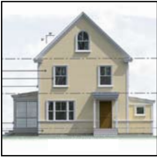
Architectural rendering of the single-family home to be built on Bancroft Street