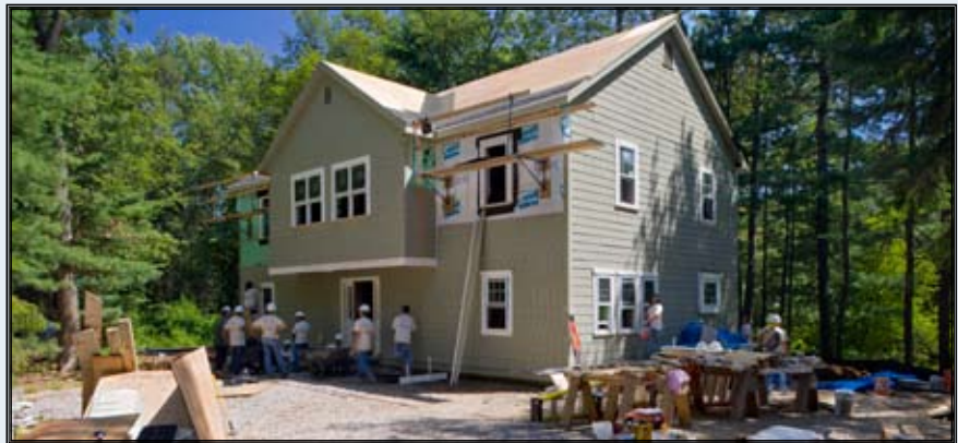
Volunteers completed the siding and roofing on the West Newton duplex just in time to start interior work as the weather cools.