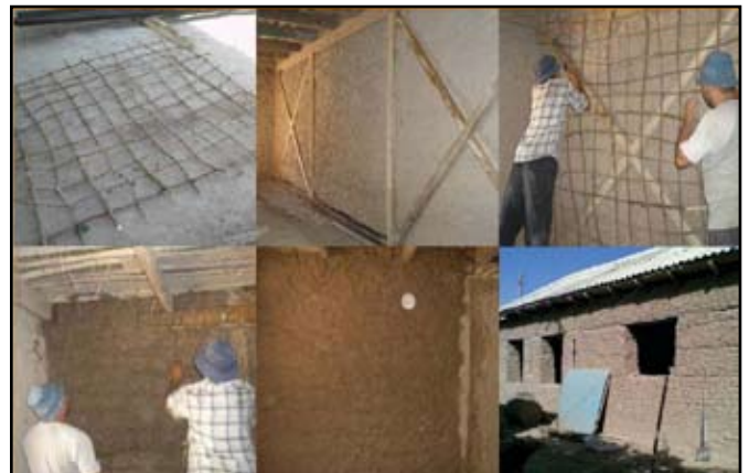
Workers build an earthquake-resistant home with "mulberry branch technology"